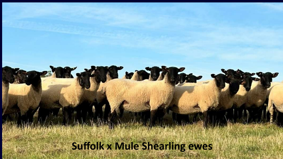
Suffolk x Mule Shearling ewes

“The first 600 lambs from this flocks 2024 lamb crop averaged £185”